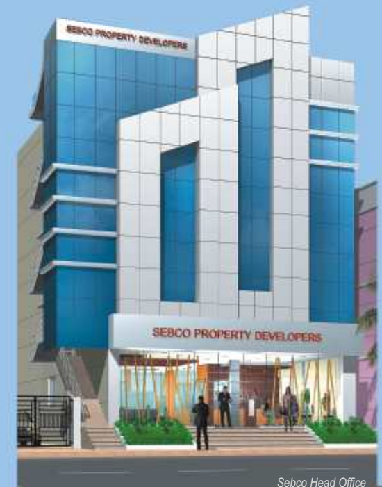
Sebco Head Office

Morais Nagar, Morais Avenue, Morais Garden, Aro Nagar are few touch stones for previous projects.